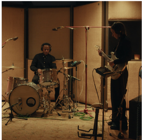
Hitachi - Sponsorizzato Hitachi alimenta il suono della trasformazione Scopri di Più